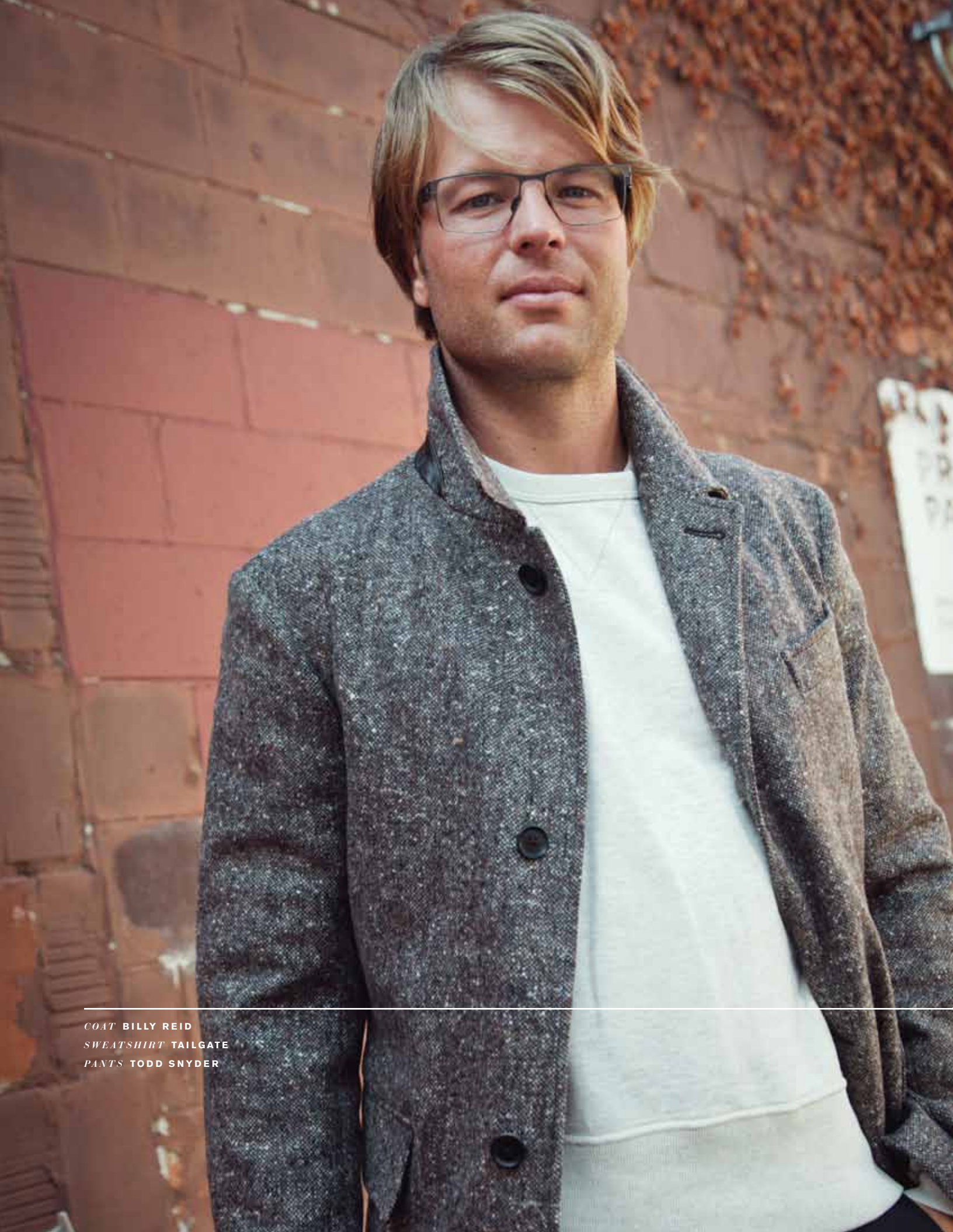
COAT BILLY REID SWEATSHIRT TAILGATE PANTS TODD SNYDER