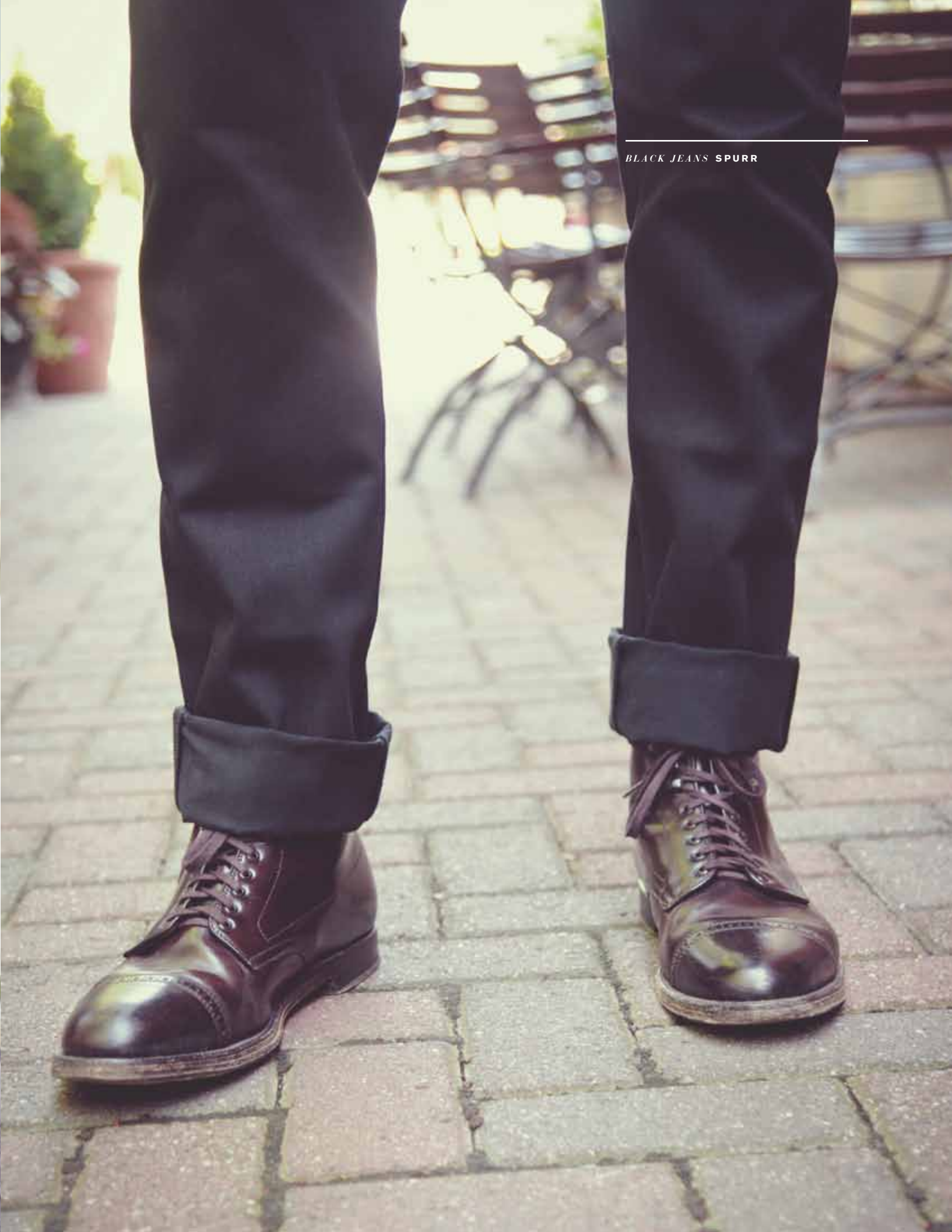
BLACK JEANS SPURR