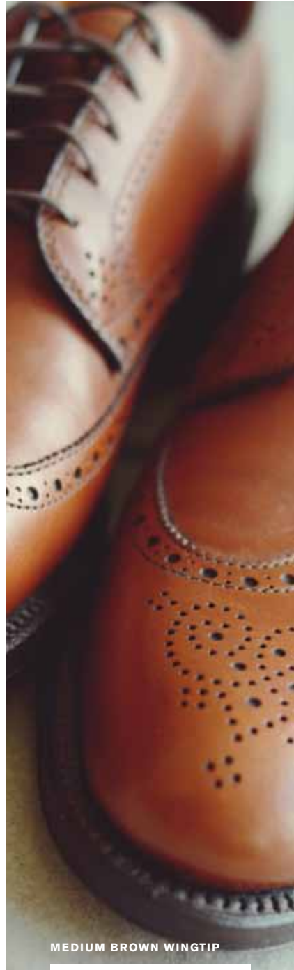
MEDIUM BROWN WINGTIP