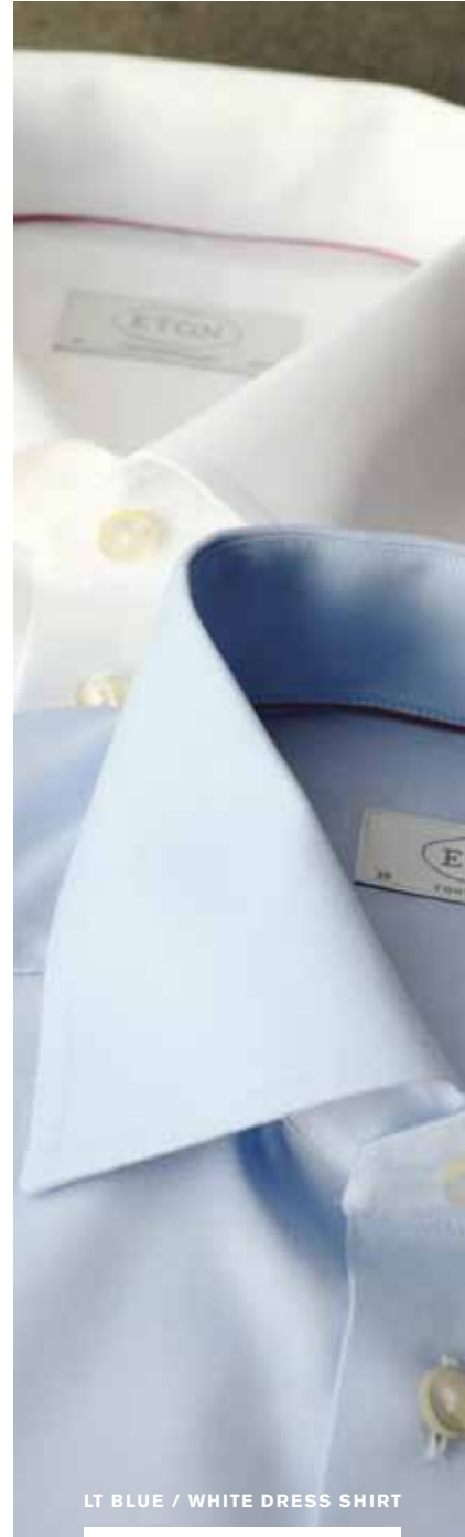
LT BLUE / WHITE DRESS SHIRT