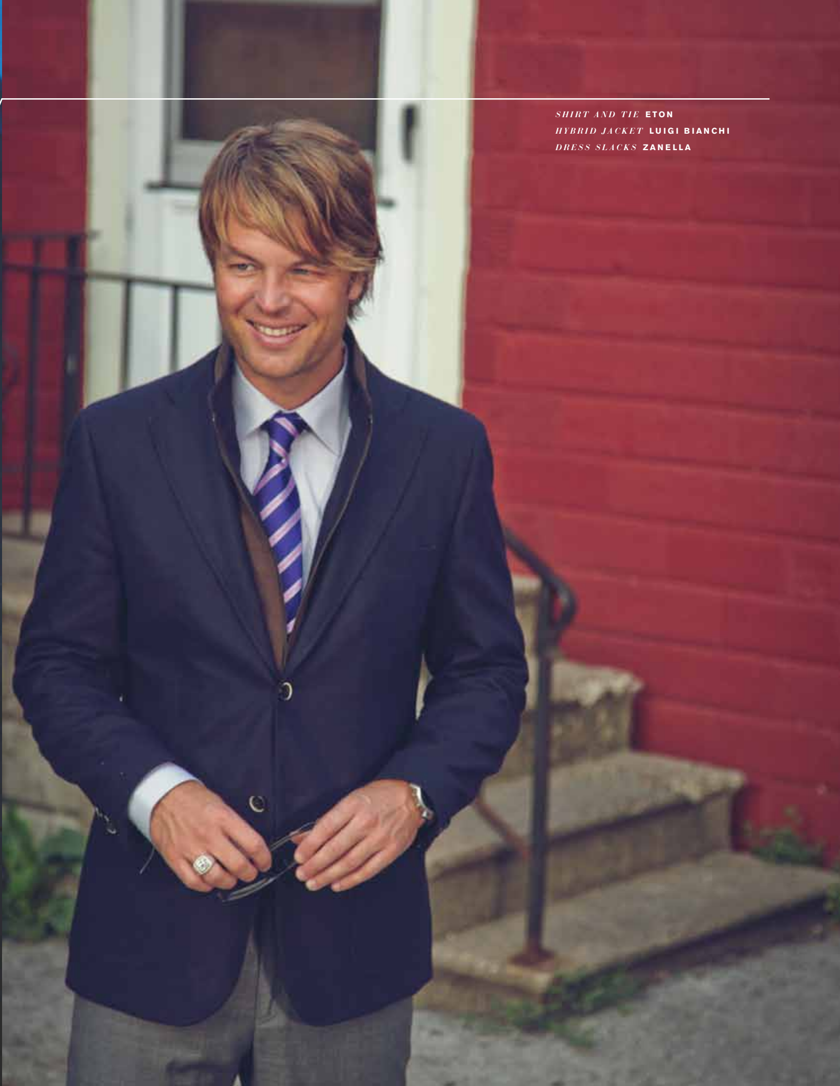
SHIRT AND TIE ETON HYBRID JACKET LUIGI BIANCHI DRESS SLACKS ZANELLA