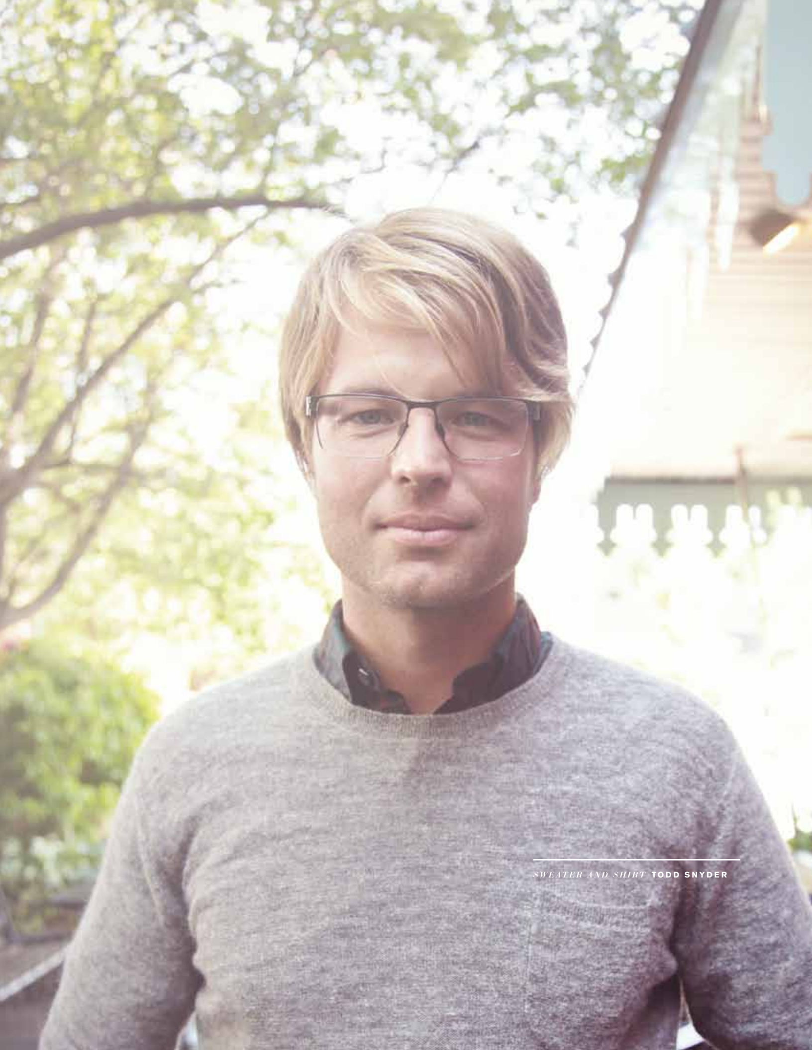
SWEATER AND SHIRT TODD SNYDER