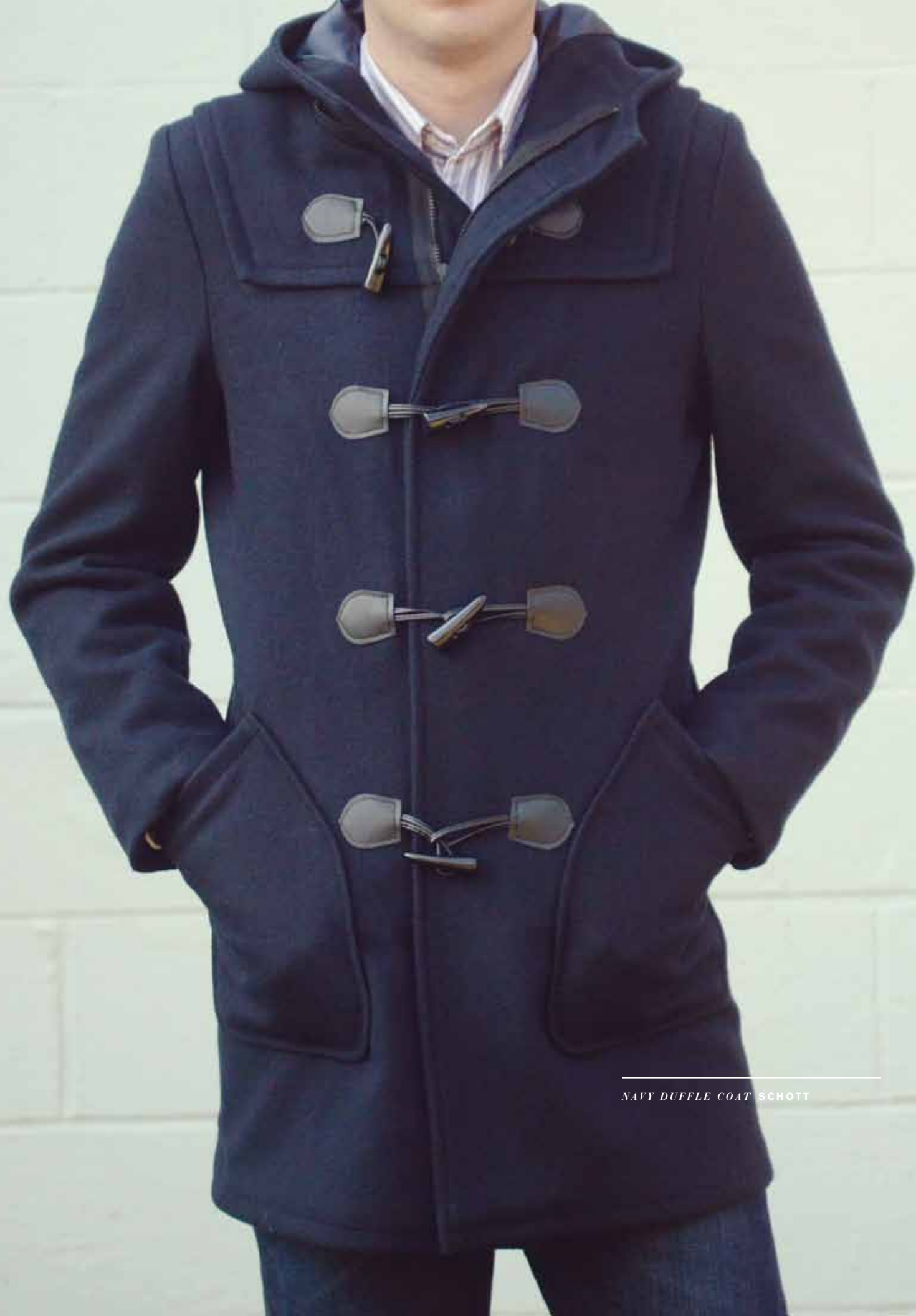
NAVY DUFFLE COAT SCHOTT