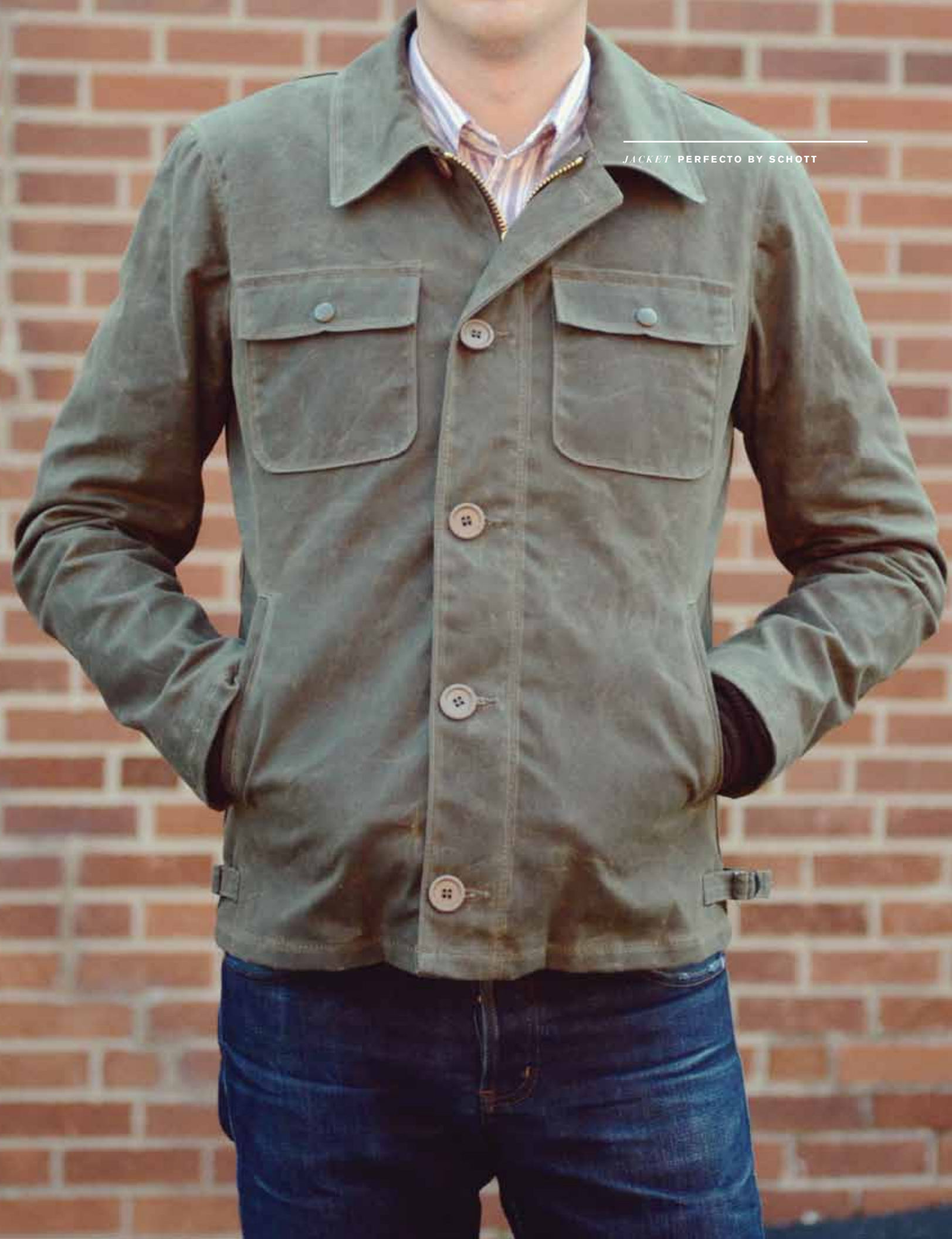
JACKET PERFECTO BY SCHOTT