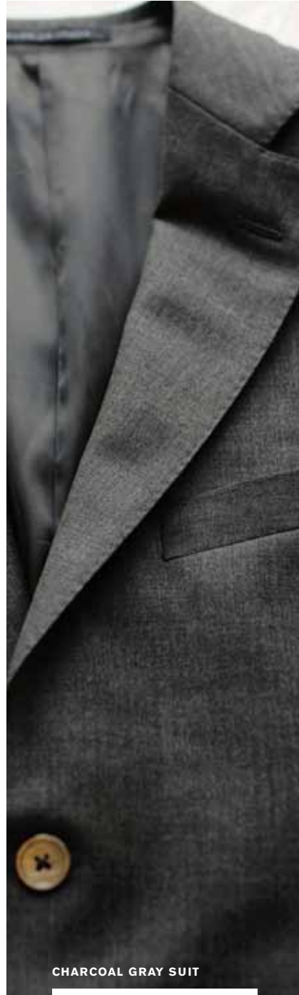
CHARCOAL GRAY SUIT